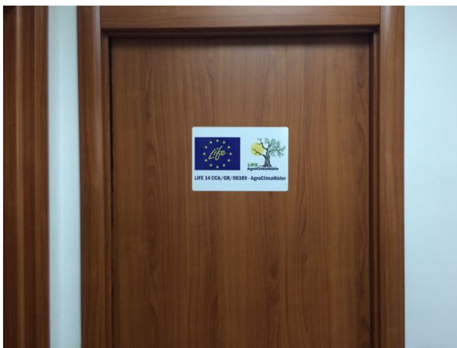
Fig. 10: Project's notice sign installed in AFI's office (Andrea Badursi's office – General Manger of AFI)

AFI installed the notice sign in its headquarters in order to publicise the project, as shown in Fig. 10.