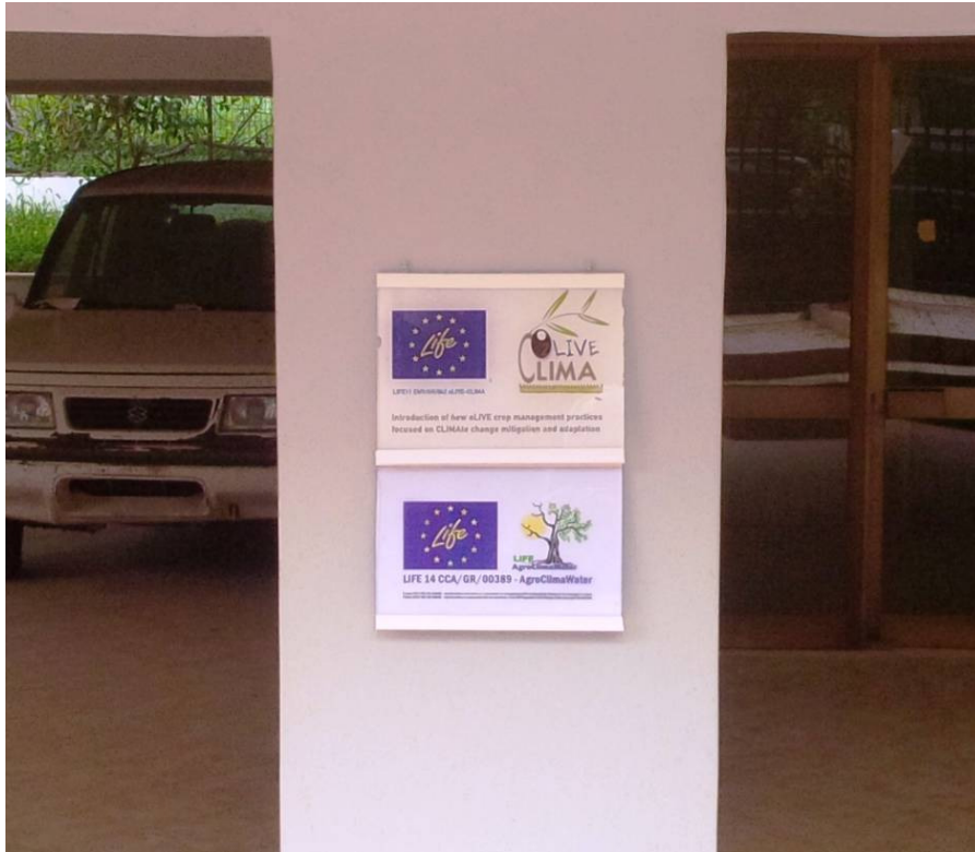
Fig. 16: Project's notice sign installed in RodaxAgro's office