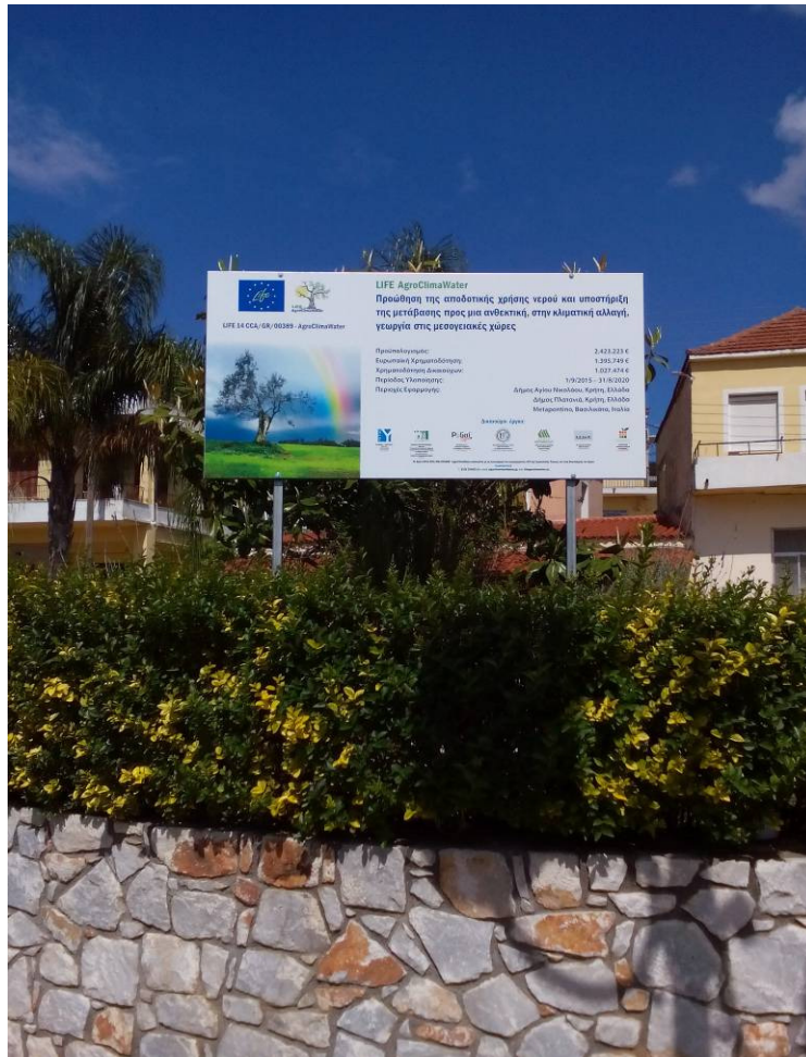
Fig. 4: Installation of the first notice board in Voukolies

KEDHP installed both of the notice boards in strategic places (Fig. 4 & Fig. 5) in order to inform the respected stakeholders for the implementation of the project.