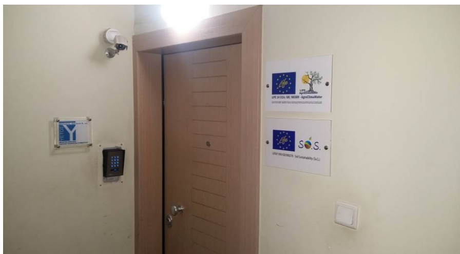
Fig. 9: Project's notice sign installed in HYETOS' office