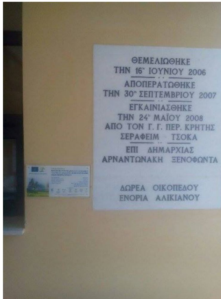
Fig. 13: Project's notice sign installed in KEDHP's office in Alikianos