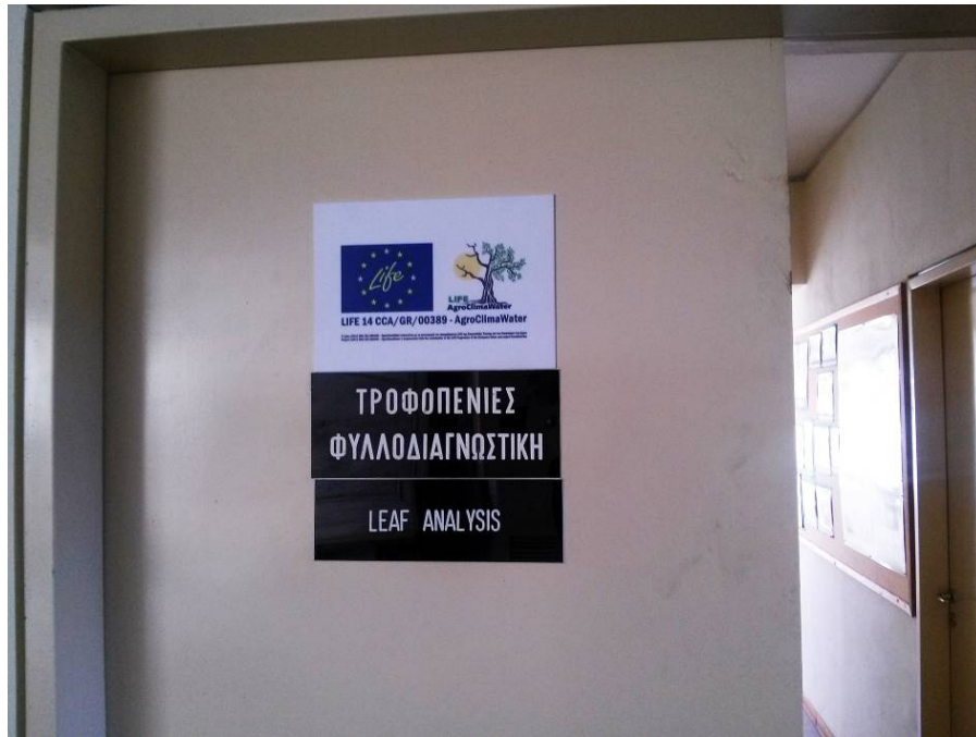
Fig. 11: Project's notice sign installed in IOTSP's office