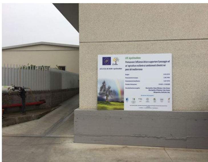
Fig. 3: Installation of the second notice board in AFI premises