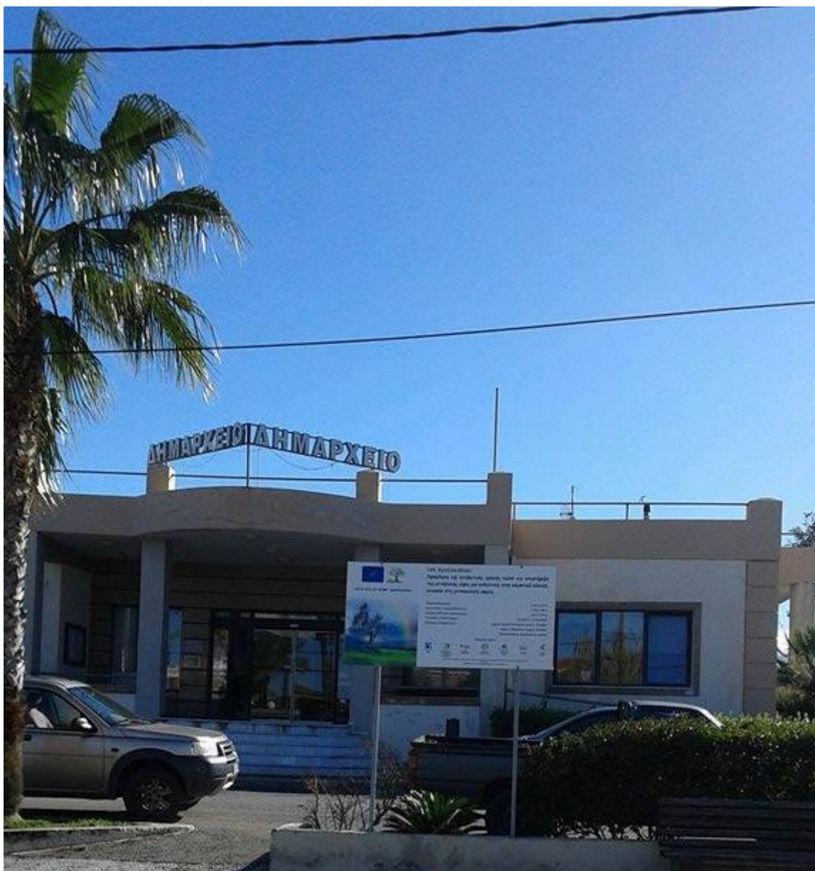
Fig. 5: Installation of the second notice board in Gerani