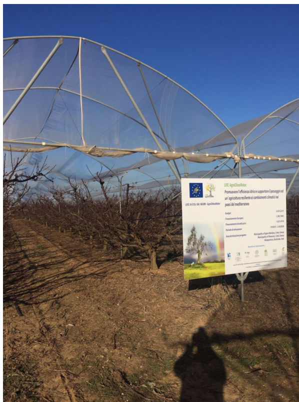
Fig. 2: Installation of the first notice board in Cooperativa Nicofruit of Tristano Alessandro

AFI purchased and installed both notice boards in places that are considered to be important for the dissemination of the project (Fig. 2 & Fig. 3)