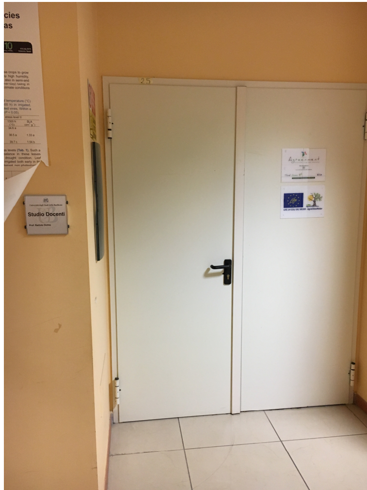
Fig. 17: Project's notice sign installed in DICEM (Professor Dichio's office door)