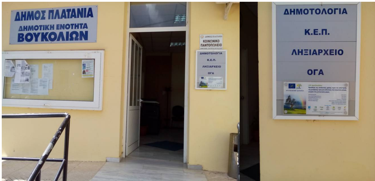
Fig. 12: Project's notice sign installed in KEDHP's office in Voukolies

KEDHP installed two signs in the entrance of its offices one in Voukolies (Fig. 12) and one in Alikianos (Fig. 13).