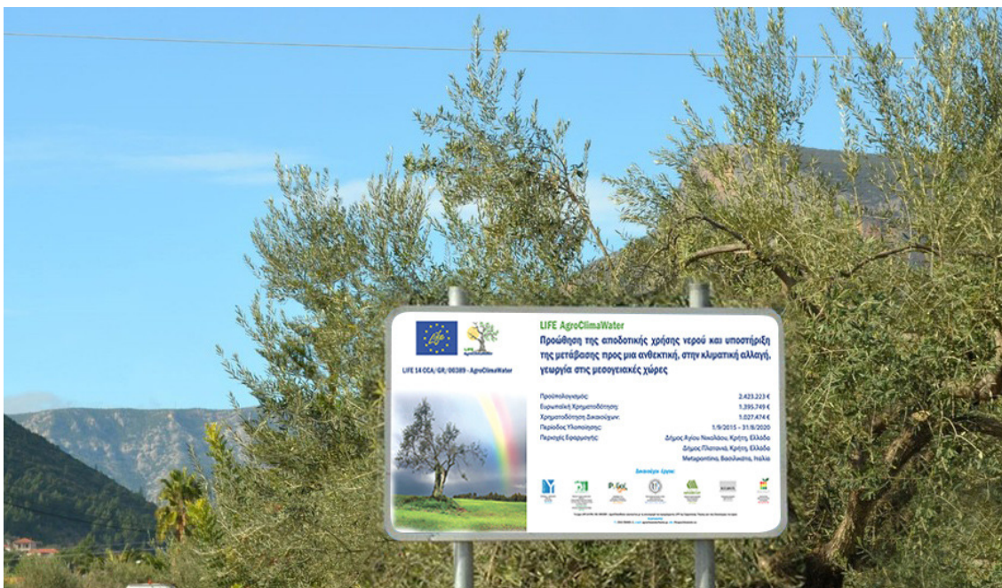
Fig. 7: Installation of the new notice board in a pilot parcel in Havgas-Milatos sub-basin