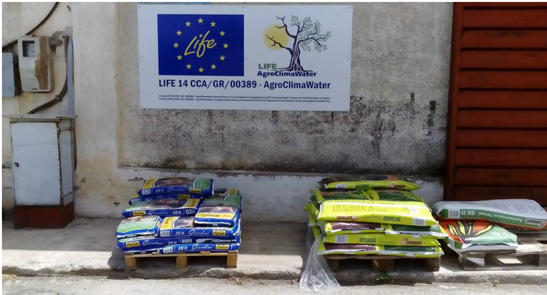
Fig. 6: Installation of the first notice board in Mirabello premises